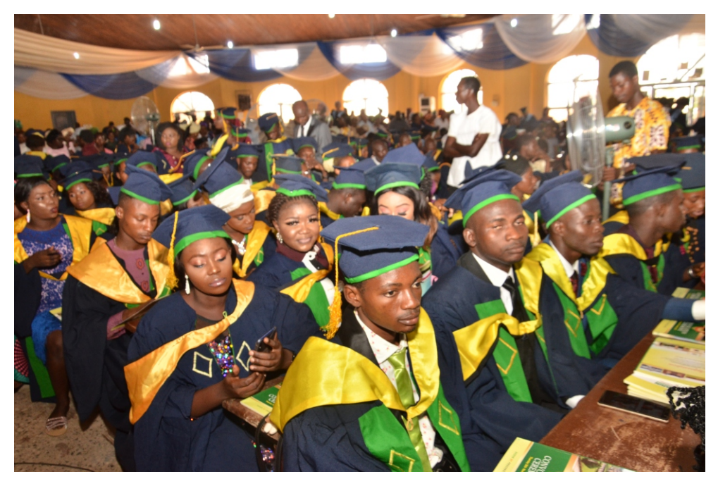
Nigerian young Graduates; leaders of tomorrow

will be affecting our tomorrow that we have not planned for . The youth has to make deliberate efforts to deconstruct all these barriers impeding their upward socio-political mobility so that the tainted leaders of tomorrow become the leaders of the present. The youth of this nation must wake up to their responsibilities, be ready to overcome the today's leadership challenges that have made our younger generations less involved in leadership roles